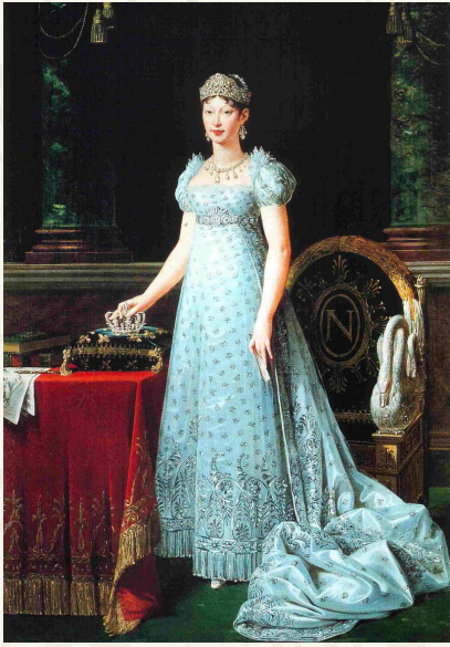
Archduchess Marie Louise, painted in 1812

Metternich got his first diplomatic job in October, around the time the Treaty of Schönbrunn was signed ending hostilities with France.