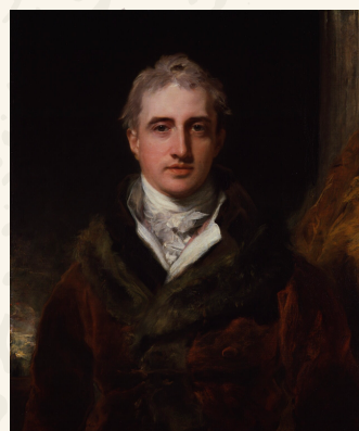
Castlereagh, British representative at Aix-La-Chapelle (painted 1809-1810)

Metternich expanded Austria's alliance with Britain. The British sought stability on the continent, meanwhile, the Austrians sought stability for its survival. Metternich would seek to weaken Russia's policy influence on Austrian affairs.