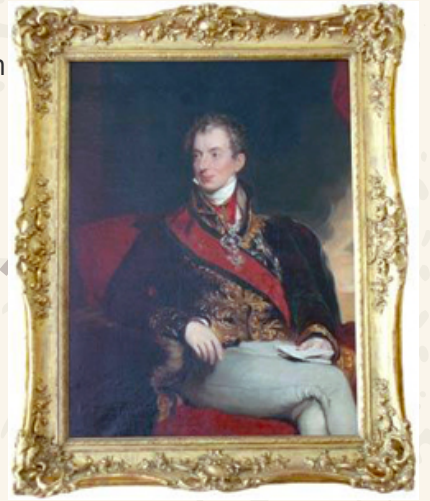
Painted in 1815

As a result of his work seeking to increase Austrian interests in Europe, Metternich became influential and respected to the extent of being awarded the title “prince”, a hereditary title.