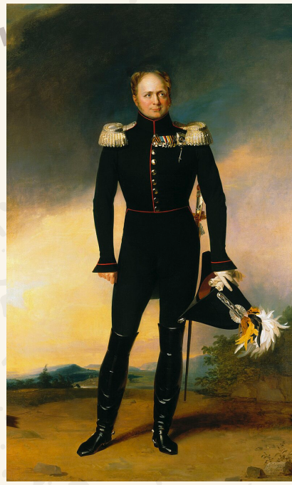
Tsar Alexander I of Russia (painted 1820)

By now, Metternich had Alexander wrapped around his finger, they agreed that the three Eastern powers of Prussia, Austria and Russia have the authority to 'police Europe', from political and social unrest.